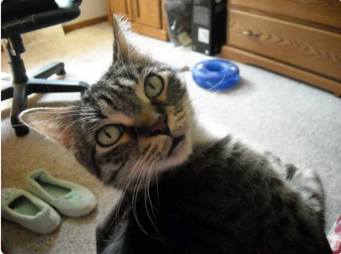
Bonnie's cat - "T"